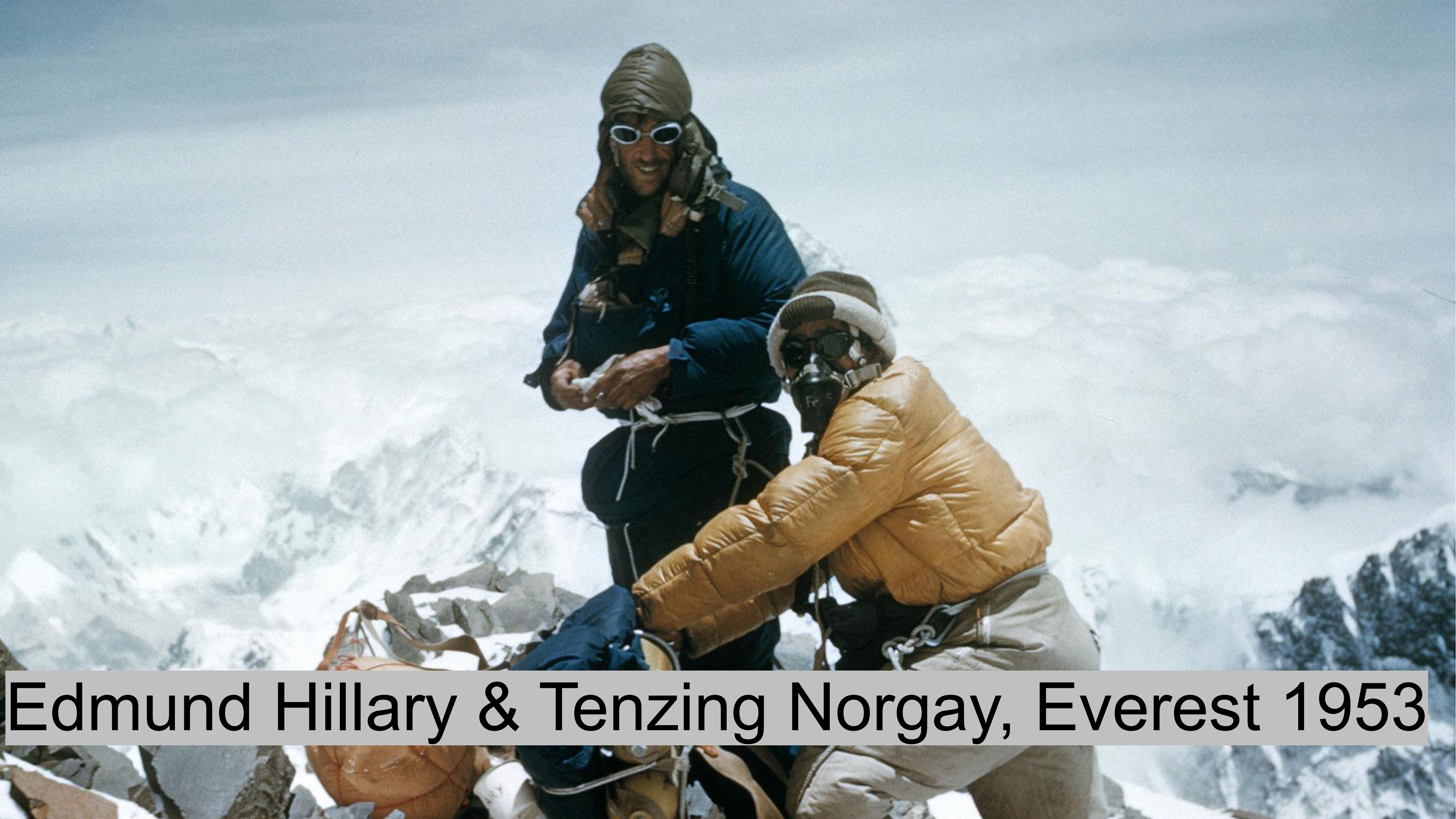
Edmund Hillary & Tenzing Norgay, Everest 1953