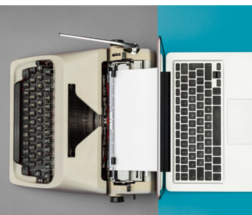
The Partnership reduced their signed document turnaround time from a week to 5 minutes by transitioning from paper processes to SignIT

The Partnership have also seen the benefit of reducing the timeline of having signed documents returned. Averaging a week to turnaround the signed and witnessed paperwork, with the first electronic deed they were able to achieve having it signed and witnessed within five minutes. A win during a critical point of the deal and with the limitations faced during lockdown.